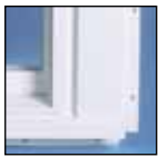
3" flat with sill nose